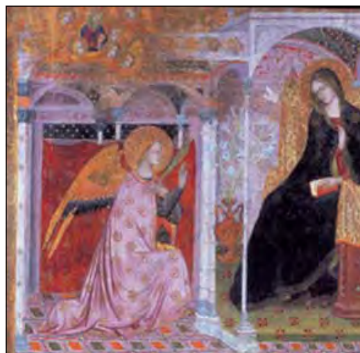
Fresco in the Basilica of Our Lady of the Angels in Assisi Italy

O Virgin of the Angels, hear the prayer of your children who trust in you. Your tender eyes assure us of your never failing motherly love and a promise of divine aid to all those who humbly turn to you. You are, indeed, our sweet Queen and our hope. O Lady of the Angels, through the intercession of St. Francis, obtain for us pardon for our sins and help us to keep away from sin and indifference, so that we shall be worthy of calling you our Mother for evermore. Bless our homes, our toil and our rest. Help those who are in need and hungry, those who are in danger of body and soul, those who are sad and downhearted, those who are sick and dying. Bless our newly merged parish dedicated to you and give us courage, hope and peace. Amen (Continued in Italian and Spanish on Page 7)